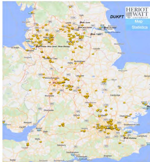
Figure 2: Snapshot of modeling simulation in Anylogic.

is an important step in model development as it can help ensure that the model represents the system and can provide accurate assessment and useful insights. The model cannot be validated because we simulate future scenarios without real-world data, which is a common challenge in modeling future scenarios. However, we establish baseline scenarios using diesel-powered vehicles and compare them to scenarios involving battery HGVs and hydrogen-powered HGVs in road freight. In this comparison, we aim to assess the magnitude of benefits associated with the adoption of battery HGVs and hydrogen-powered HGVs relative to the baseline scenarios.