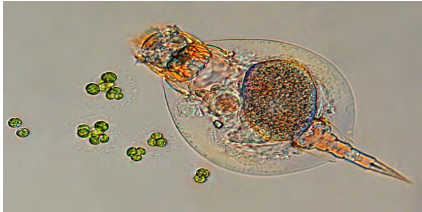
Figure 1: Rotifer-algae predator-prey system.

when explanations are crucial. Explainable AI program launched in 2017 (Adadi and Berrada 2018), emphasized the need to create models that are both highly accurate and easily understandable by humans, thereby allowing them to effectively utilize and manage the new insights of intelligent systems. The main objective of XAI techniques is to improve the explainability of the model’s decision-making logic and the reasoning behind model recommendations and suggestions. Gregor and Benbasat (1999) describe explainability as a “declaration of the meaning of words spoken, actions, motives, etc., with a view to adjusting a misunderstanding or reconciling differences”. Explainability also helps to understand the system’s malfunctions or anomalies.