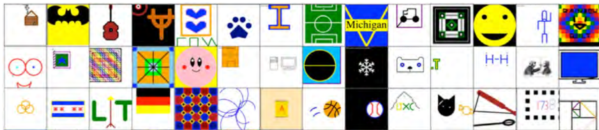
Fig. 3. A portion of the class quilt web page comprised of patches written by students.

projects submitted in the two settings, online resources shaped the assignment both in terms of the content of the projects themselves and in how students shared and discussed their work. For example, one student in the CT4G class decided to make her final project a recreation of her favorite Justin Bieber Song, “Baby”, by writing a program to animate the chorus of the song, which used iterative logic to move through various pictures of babies pulled from the Internet and culminated in a picture of Justin Bieber and a sign saying “You’re Welcome” (Fig. 2A). When the class was given a chance to share their work at the end of the last day of the Pencil Code unit, this student eagerly volunteered to present her project, getting the class to join in and sing along with her and her program.