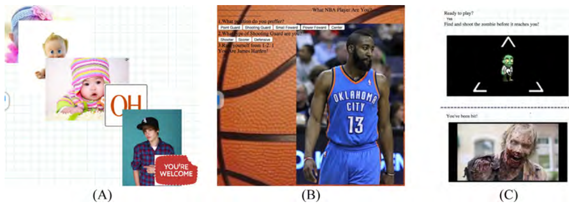
Fig. 2. Three examples of media-rich projects that incorporated resources for the Internet.