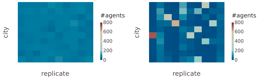
Figure 4: Number of agents passing through each exit city over the course of 100 time units for ten replicate runs (Julia model on the left, ML3 on the right).

- required to build models by composing them from simpler models - without resorting to expensive runtime polymorphism.