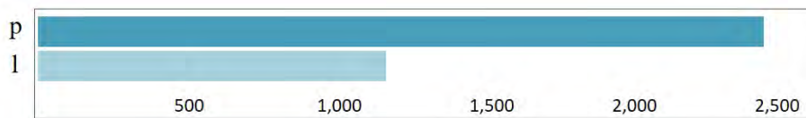
Figure 3: Variable Importance: Impact of p and \ell on the mean fill rate.

We observe that the sensitivity of the fill rate to the disruption probability decreases as less amount of inventory is lost in the presence of a disruption. The coefficient of variation for the fill rate takes its highest value for 50% disruption probability under the assumption of full loss of inventory in the presence of a disruption. Obviously, the mean fill rate is the most sensitive to the probability of disruption p followed by the fraction of inventory loss \ell for any given size of the demand. The relative importance of these two input variables on the mean fill rate is visualized in Figure 3. The numerical values reported in this figure are obtained in two steps: First, SAS GRADBOOST procedure is used to create a gradient boosting model. Second, the change in the residual sum of square errors is calculated for each input variable. For a more detailed description, we refer the reader to the procedures guide on SAS ® Viya ™ Data Mining and Machine Learning (SAS Institute 2019).