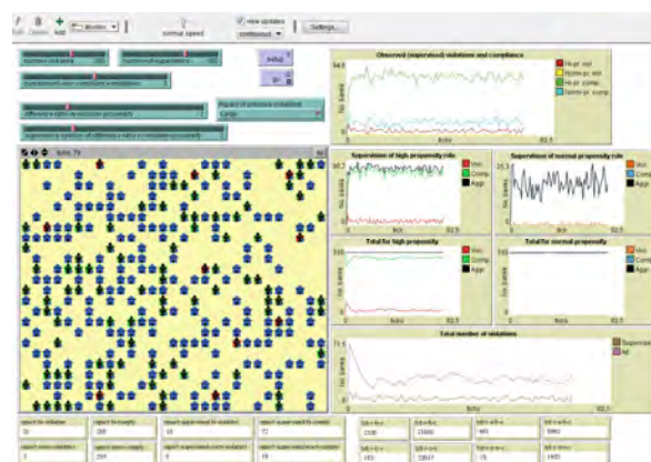
Figure 3. Simulation environment

Computer simulation of the model described in chapter 4 was developed and performed in NetLogo environment. NetLogo was chosen because of its simplicity, ease of use, high level of abstraction and resulting possibility for rapid development. Screenshot of simulation environment is shown in Fig. 3.