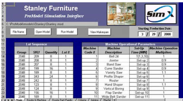
Figure 3: Front-end Interface (User inputs)

With the interface a user manipulates fields controlling basic input parameters such as run length, data, number of machines, and shifts. However, Sim X has taken the level of available detail one step further by integrating access to complete bill of material lists and product routings regarding thousands of parts assigned to the facility for production. The availability of options provided through the custom interfaces transforms the model from a facility-planning tool to an operational planning tool (see Figure 3).